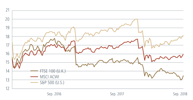
Chart 3: UK Valuations Down Significantly Since Brexit 12-month forward P/E ratios